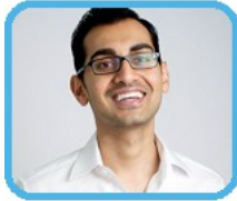
Neil Patel neilpatel.com

“Recurring revenue is the best form of income!”